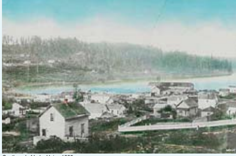
South end of Lake Union, 1885

before 1870 Native American settlement at south end of Maman Hartshu, or Texas Chuck (meaning Little Lake)