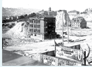
Denny Regrade The last phase of the Denny Regrade leveled a substantial hill that once stood between Downtown and Lake Union.

2000s Work underway to create a dense mixed-use community