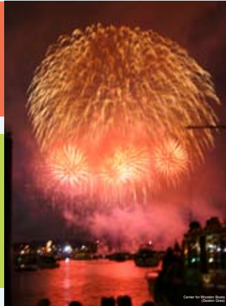
Center for Woodson Board Street Green