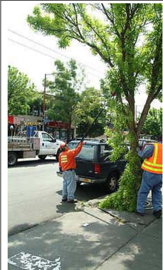
Seattle Department of Transportation Urban Forestry Workers