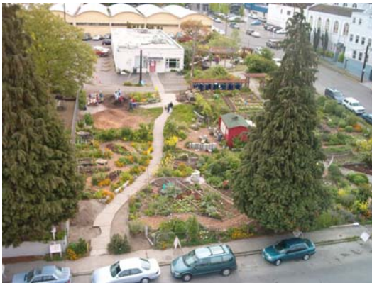
Cascade People's Center P-Patch