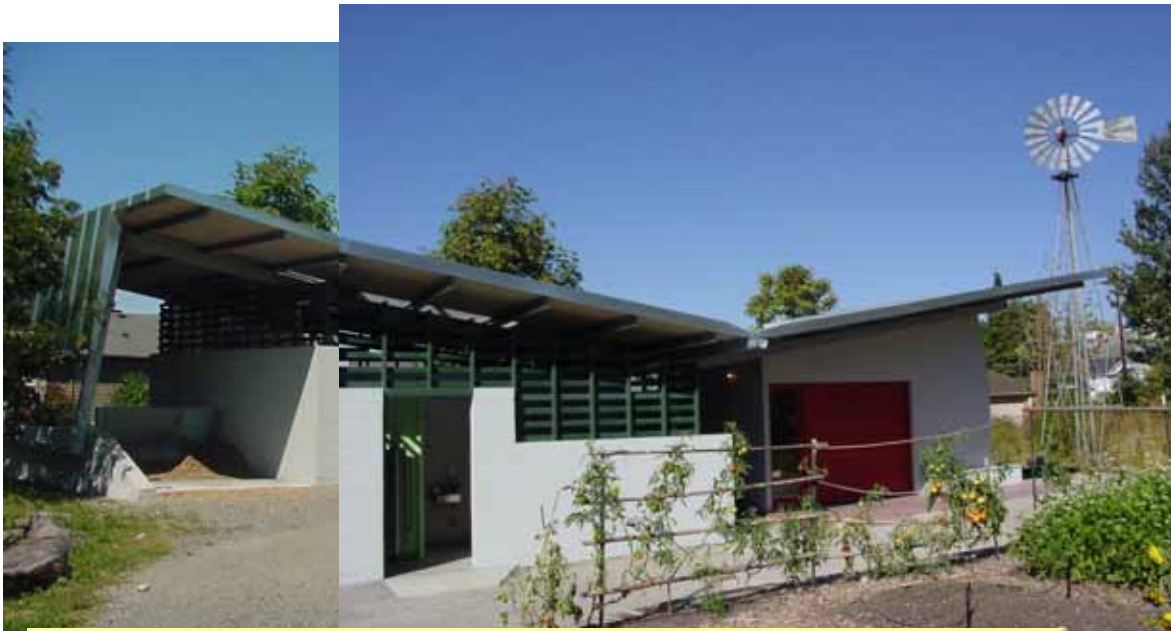
Outdoor compost storage, bathroom, kiosk passageway, classroom