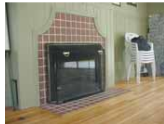
Furniture storage beside electric fireplace