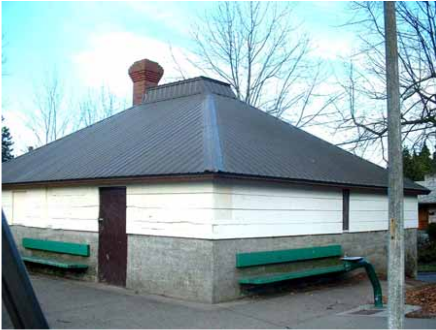
Shelterhouse is near play area and basketball half court