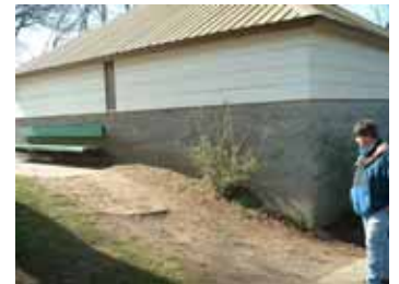
Exterior landscaping and access could improve