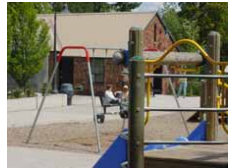
Shelterhouse abuts play, basketball, tennis, and plaza areas