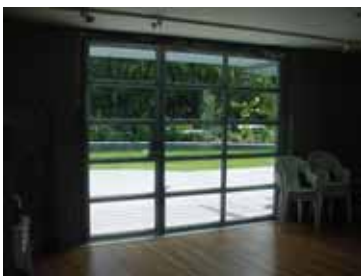
Triple doors open onto plaza