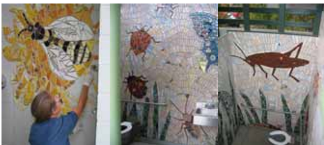
Community art decorates unisex bathroom