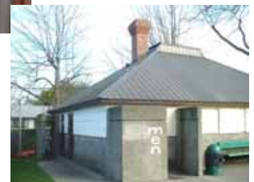
Skylight, fireplace, paneling, built-ins are natural assets