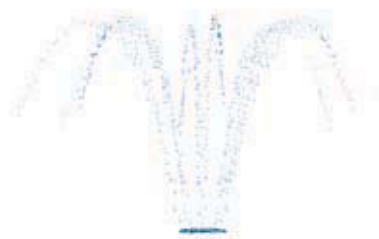
mop top C02-255