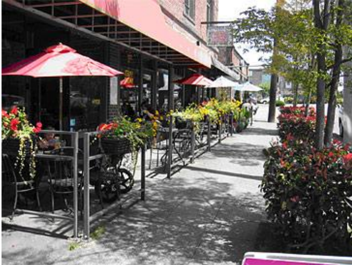
Example of an attractive sidewalk cafe with required pedestrian clearances

Do you want to expand your restaurant or café to include open-air seating on the sidewalk? Consider applying for a street use permit. The City of Seattle encourages sidewalk cafes to increase public use, enjoyment and safety. With proper design and management, sidewalk cafes can be a great way to encourage walking, add vitality to the street, and promote local economic development.